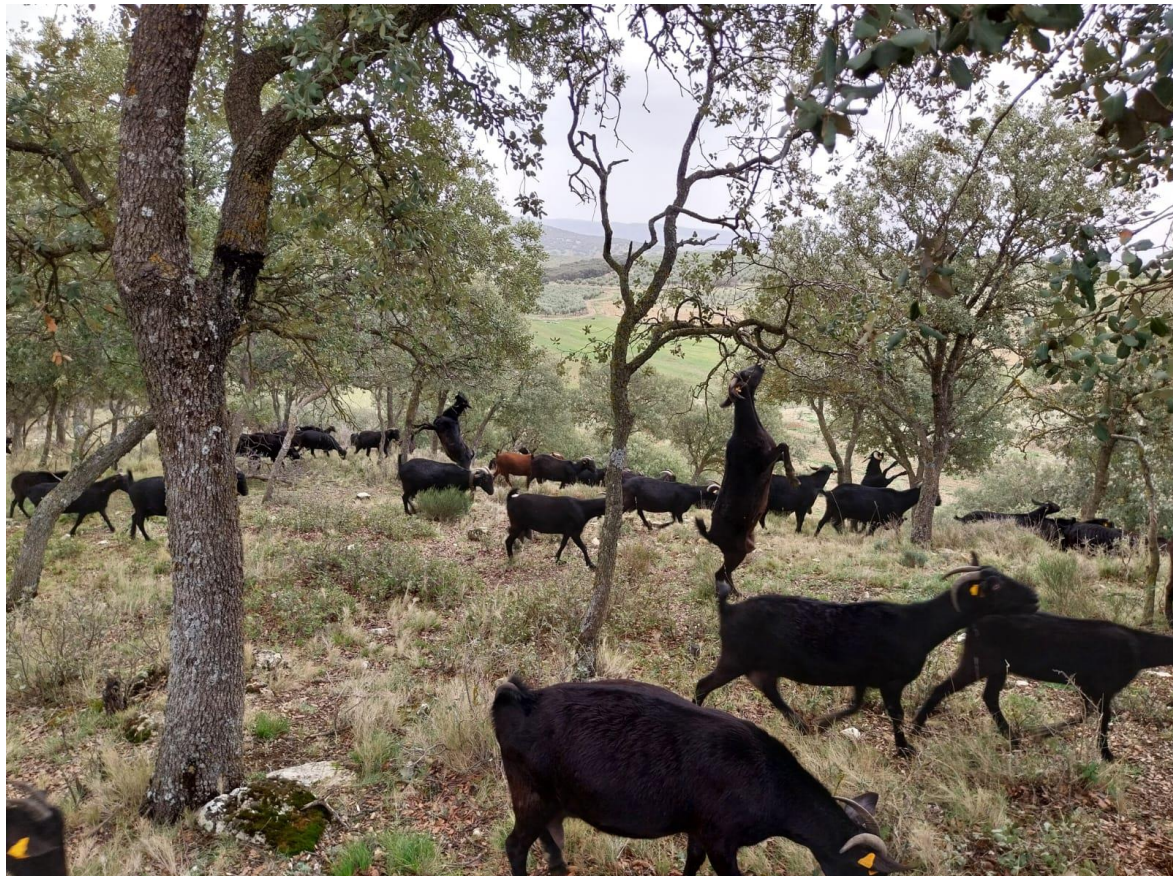
Photo: Extensive livestock farming in rural Spain, Andalucia. Photo by Matteo Metta

We, Agroecology Europe and its members, invite supporters to use this clarity to foster meaningful collaboration, protect the integrity of established frameworks, and advance a just and sustainable European food system.