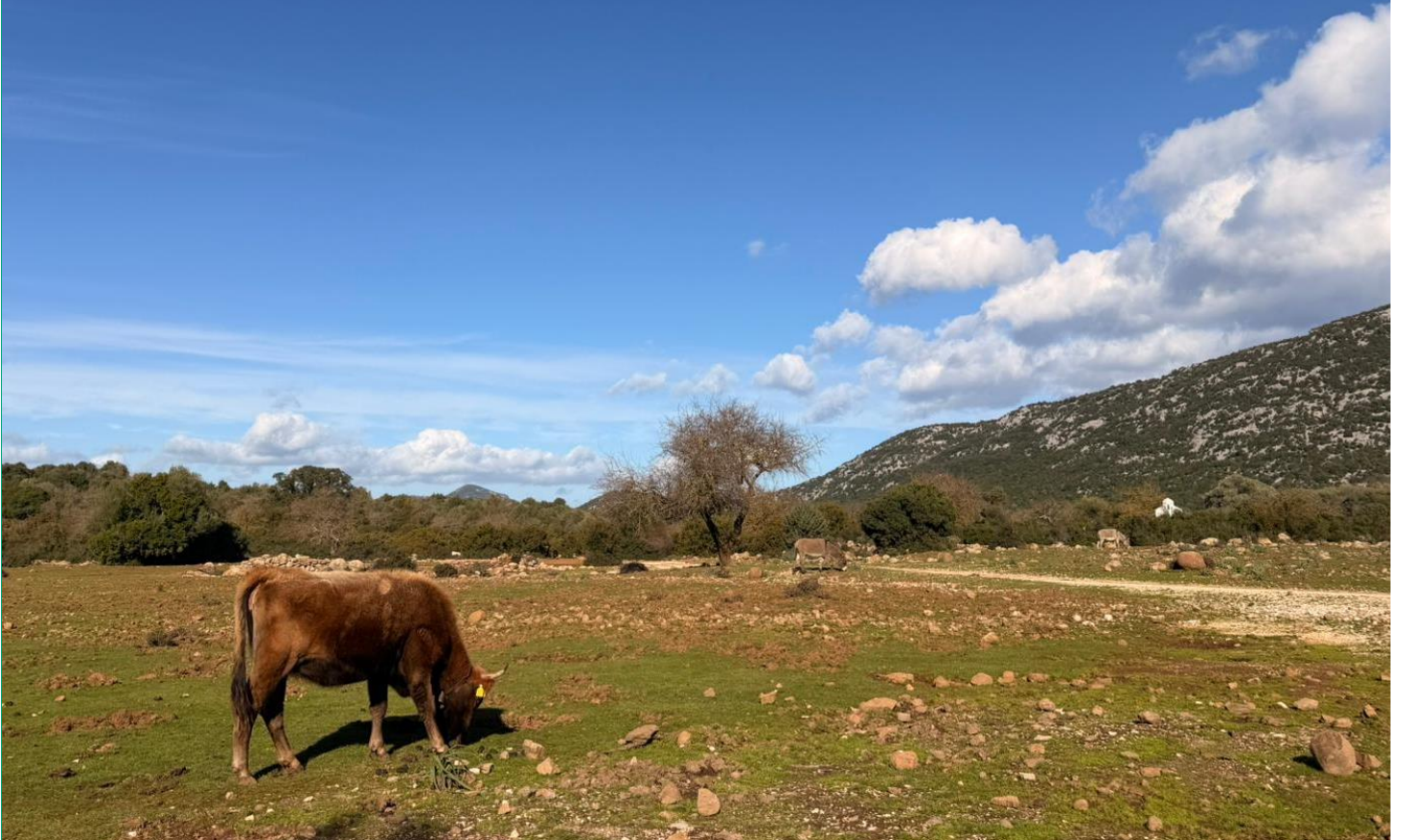
Sardinian landscape