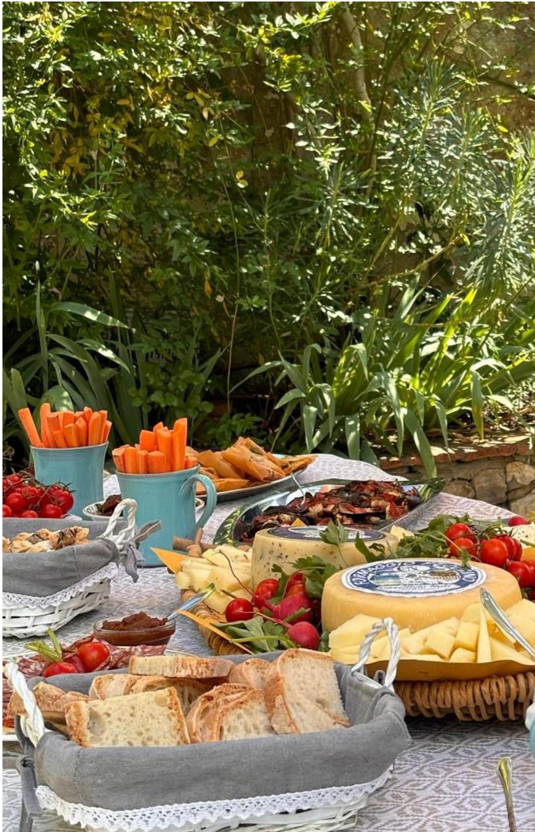
Photo: Agroecological lunch at Azienda Agricola Podere Montisi , Florence, Italy.