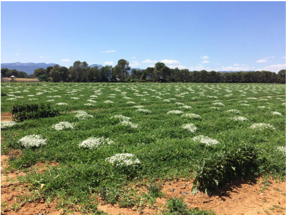
Photo: Agroecological biocontrol in action, Spain: intercropping watermelon and Lobularia maritima to eliminate the use of toxic pesticides for aphid control, while enhancing pollinators and yields.

Agroecology is beyond single metrics. It's about food quality, values, wellbeing, climate action, animal welfare, and so forth: all integrated.