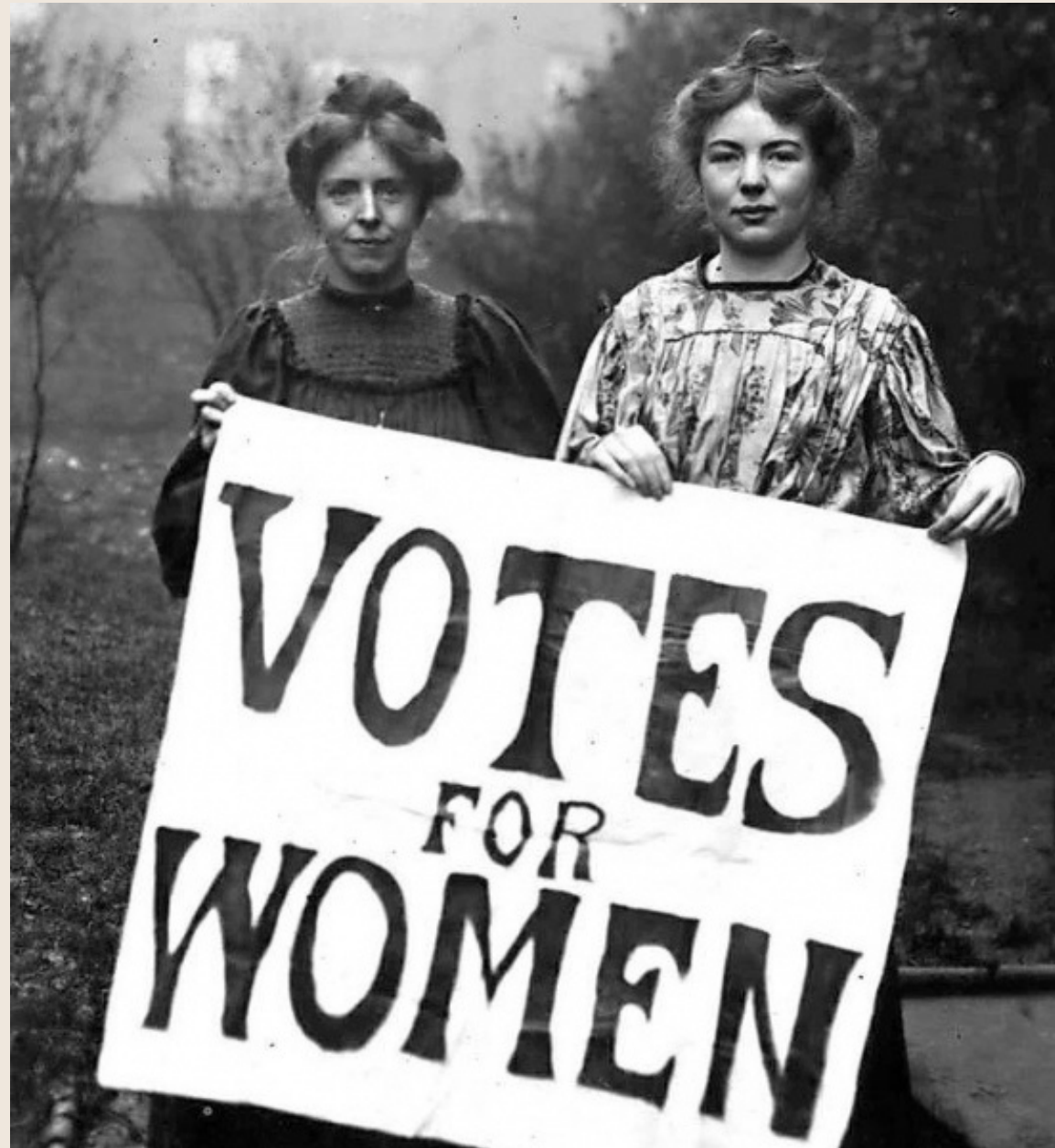
The first wave comprised women's suffrage movements of the 19th and early-20th centuries