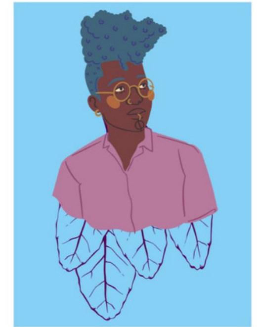
THE POLICY MAKER