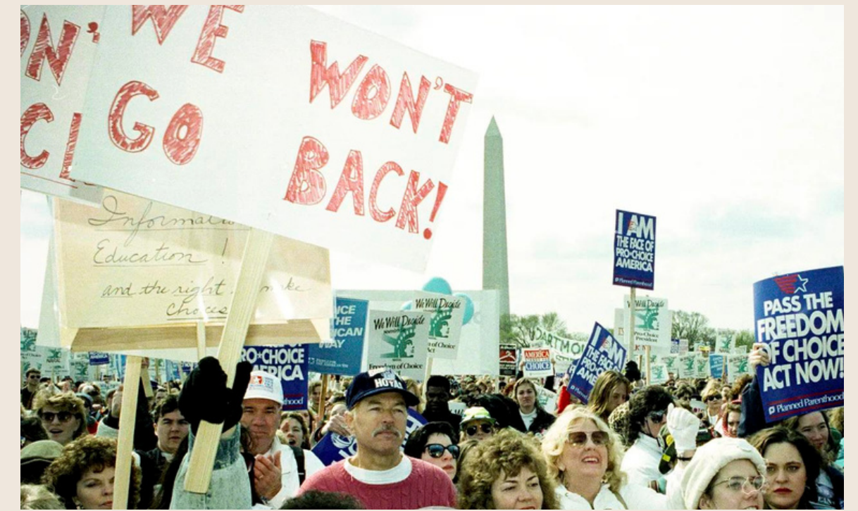
A third wave ('80s-2000)