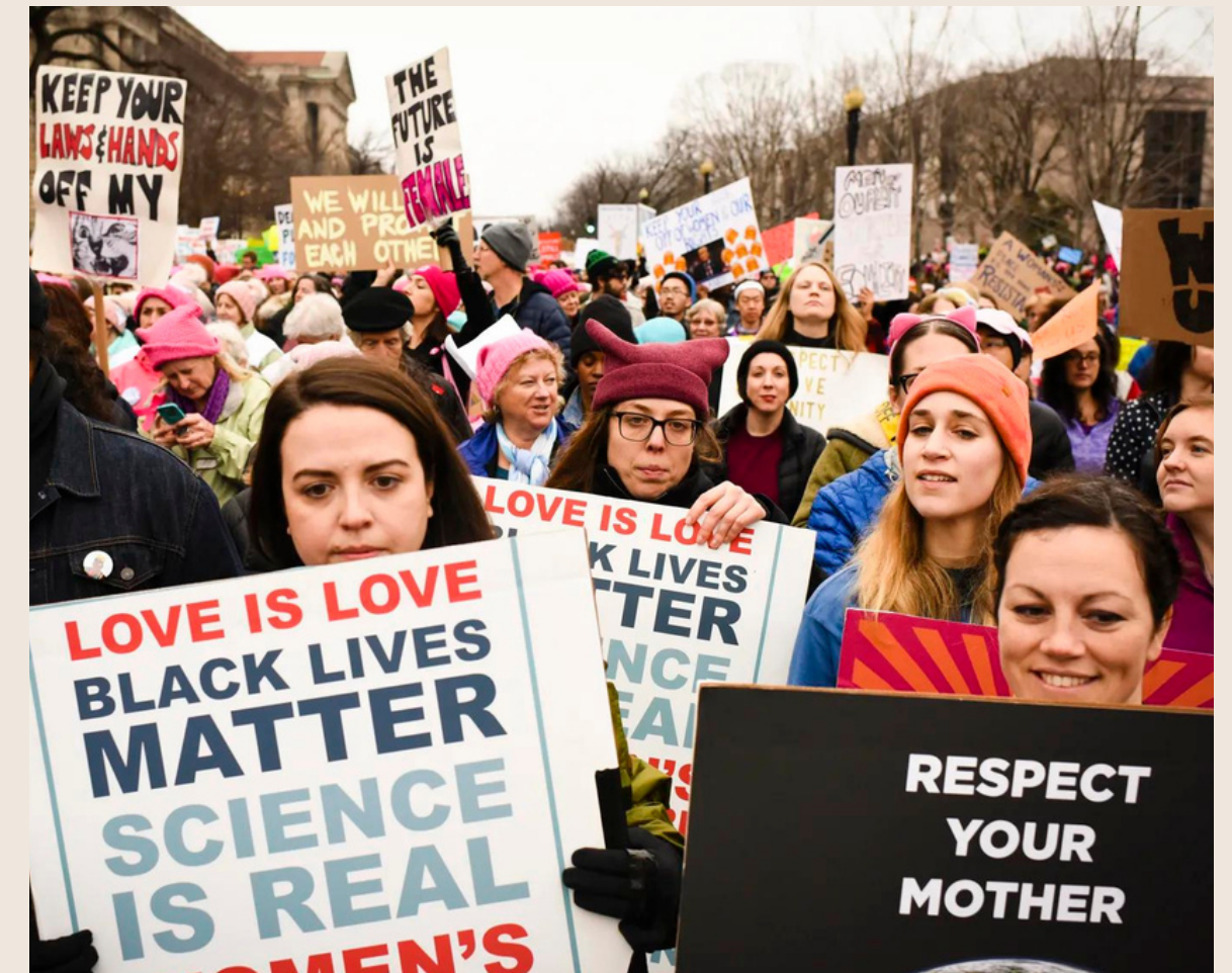
Fourth wave (from 2010 to now)