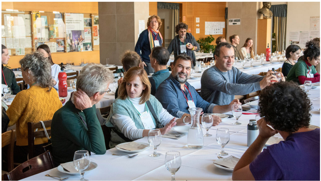
Sharing lunch made with local, agroecological ingredients.

The Forum ended with several work meetings, allowing participants to further strengthen connections and exchange ideas about collaboration—a beautiful ending—or start—to the time spent together to advocate for and practice food sovereignty and agroecology.