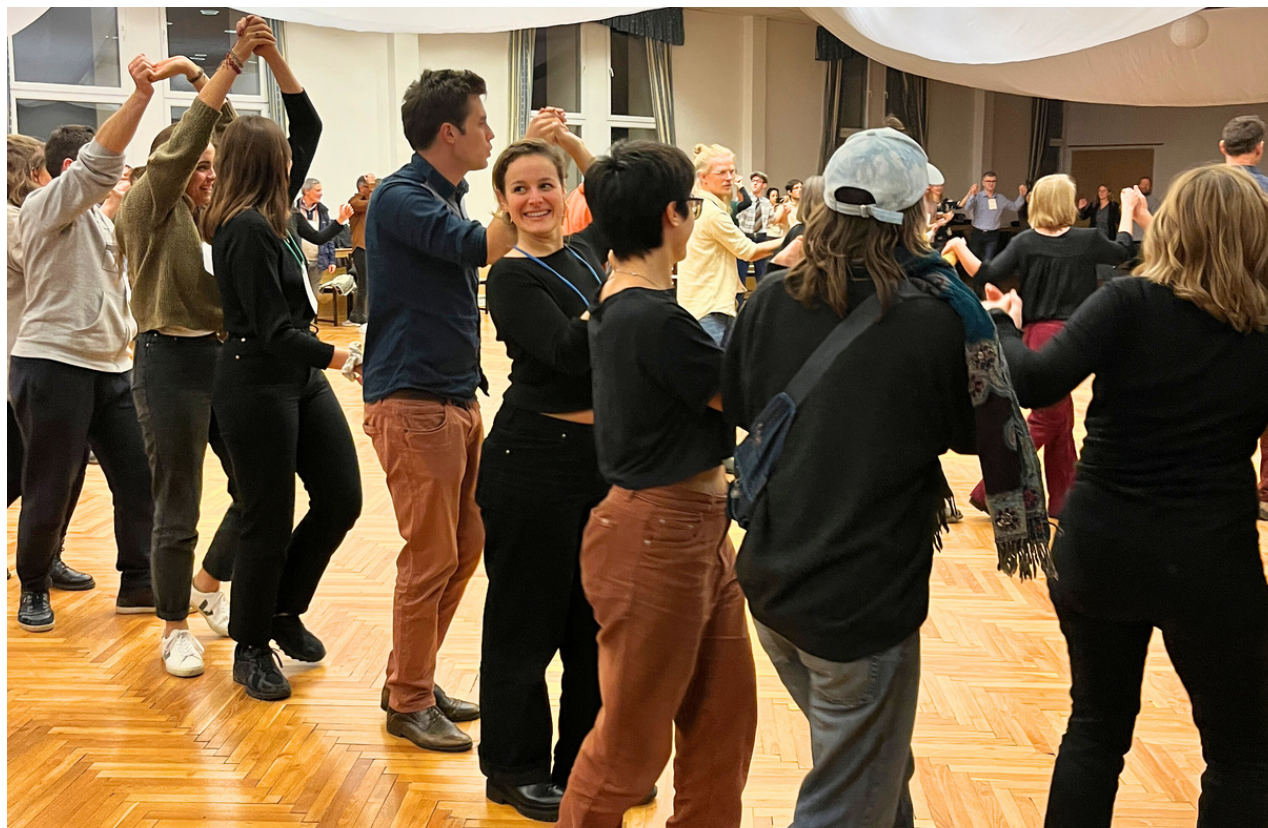
Hungarian folk dance hall.

This Forum stood out by its social ambiance leaning into community, joy, and connection. We have all made valuable professional links and even more valuable friendships. On both evenings, local folk and world musicians guaranteed that the long days end on a high note. Looking around a room full of people dancing together and smiling ear to ear reminded us of the true meaning of agroecology: connection, kindness, harmony.