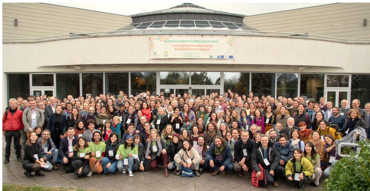
Group photo.

Almost 300 people from 36 countries came together to celebrate agroecology initiatives, strengthen synergies among social movements, and tackle the challenges ahead to transform food and farming systems. All three days were fully packed with 4 keynote speeches, 13 workshops, 9 sessions, 4 work meetings, 25 poster presentations, and 4 field visits to witness agroecology in action. As a side event, we displayed photo exhibitions on the walls to illustrate agroecology and rural livelihoods in Hungary.