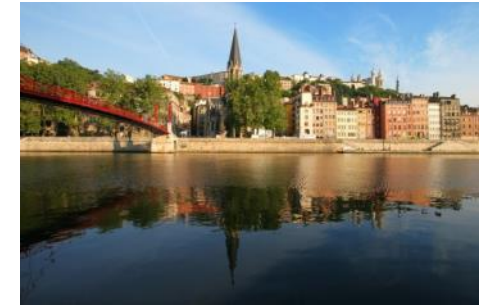
Lyon- Unesco World Heritage City