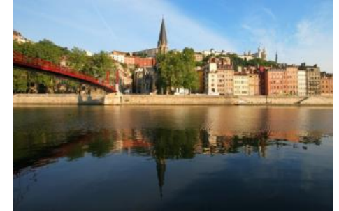
Lyon- Unesco World Heritage City